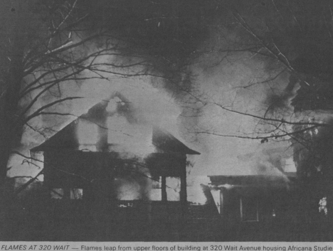
and Research Center which was swept by fire early Wednesday morning.