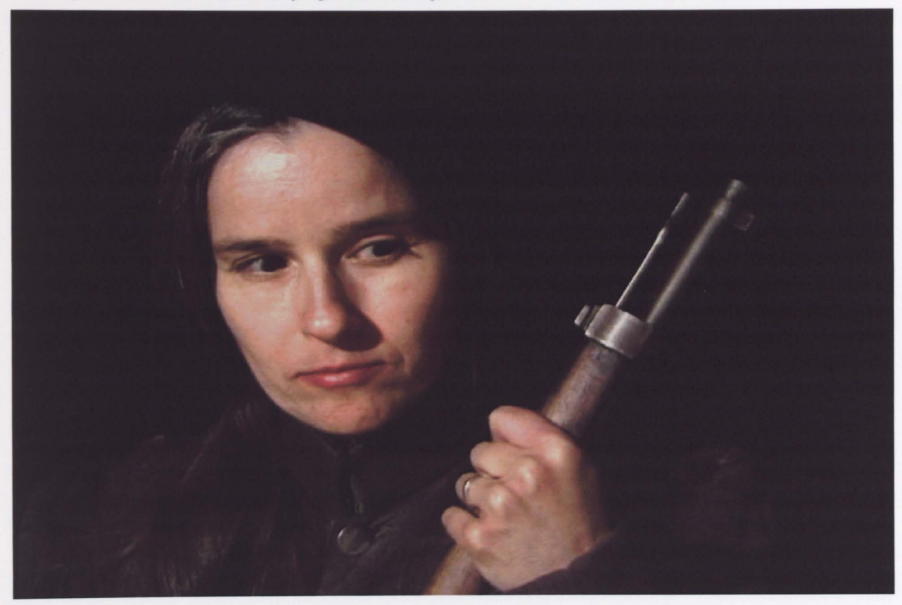
Portrait of (Unknown) Russian Partisan 42 inch plasma monitor, dvd, silent, by sigrid hackenberg, 2002