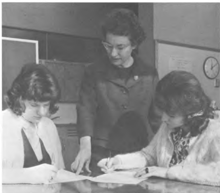
Graduate assistant collects data to help evaluate pilot program of preparation for wage earning in local high school.

education. Students who are interested in qualifying for either of two professional degrees, M.A.T. or Ed.D., may select home economics education as the field of professional concentration.