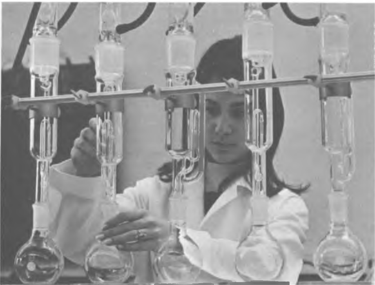
An Honors student working in a research laboratory.