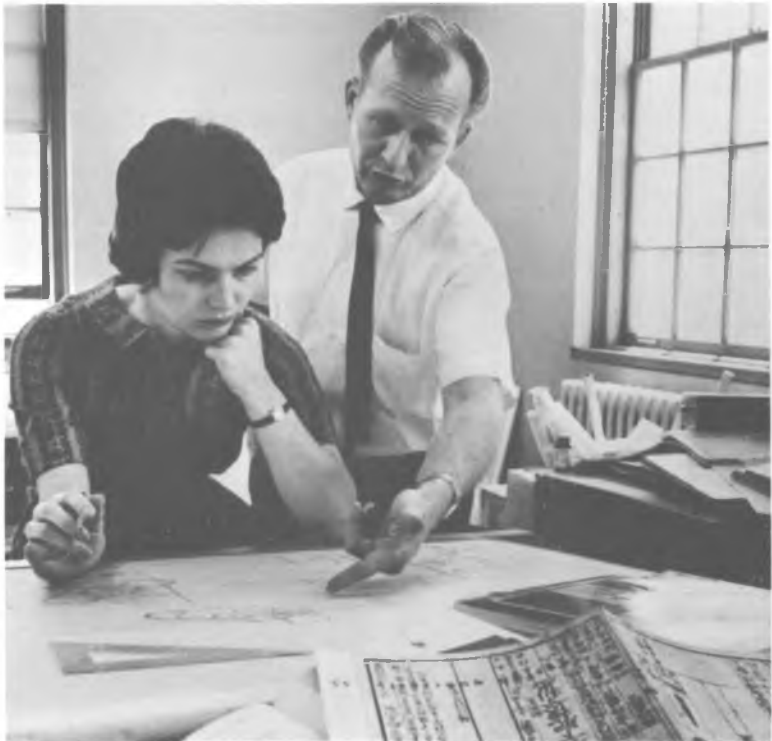
Individual critical discussions are an important part of studio courses.

Studio assignments are intended to develop awareness of these elements and sensitivity to their use. The student is encouraged to enlarge his visual experience through investigation and individual discovery and to exercise his intellectual curiosity in the search for universal principles of design. Minimum cost of materials, $7.