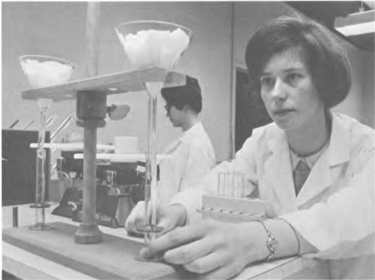
Students at work in a food science laboratory.