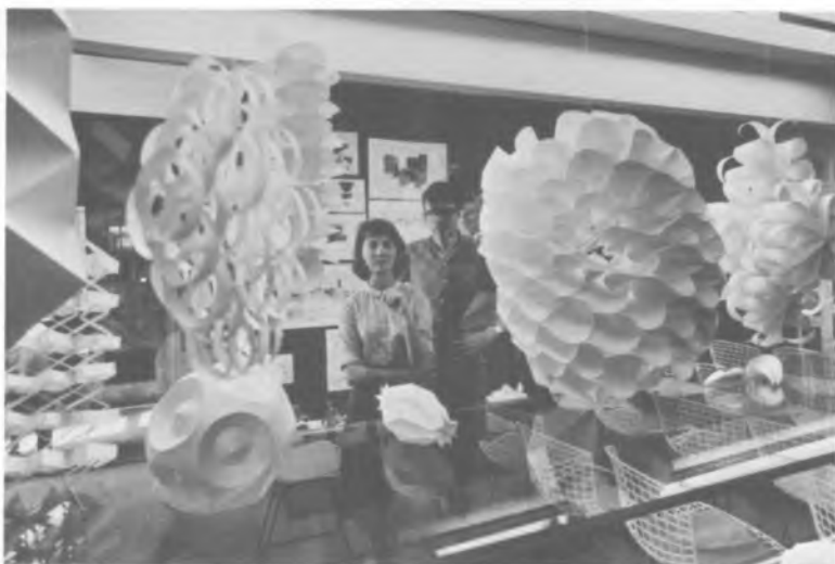
Annual exhibition of student work in design in Martha Van Rensselaer Gallery.