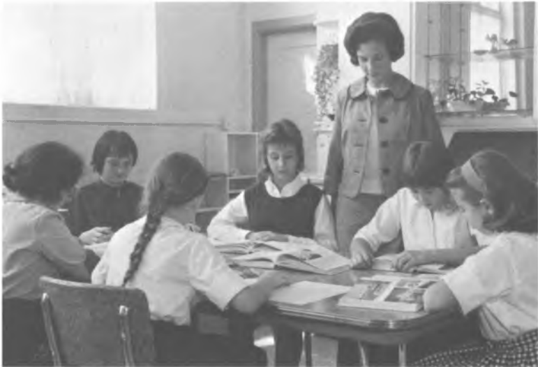
Student teacher with her junior high school class.