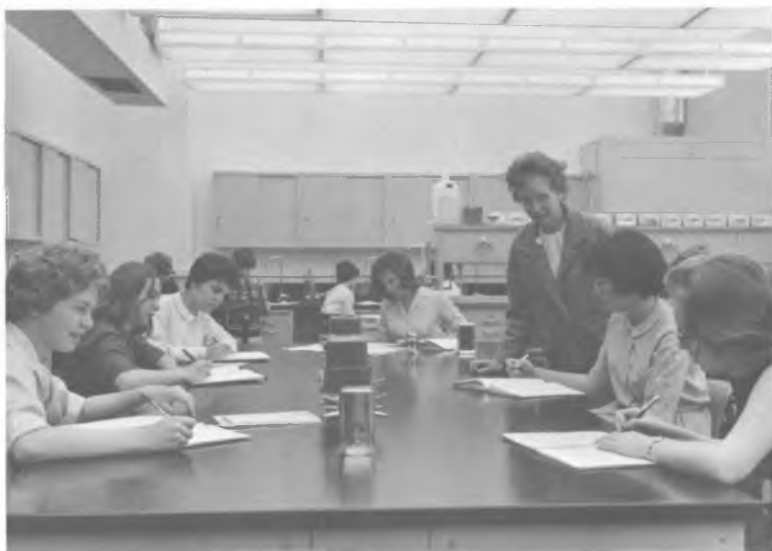
A professor in the Textiles and Clothing Department checks the laboratory observations of two freshmen in a required course for all home economics students.