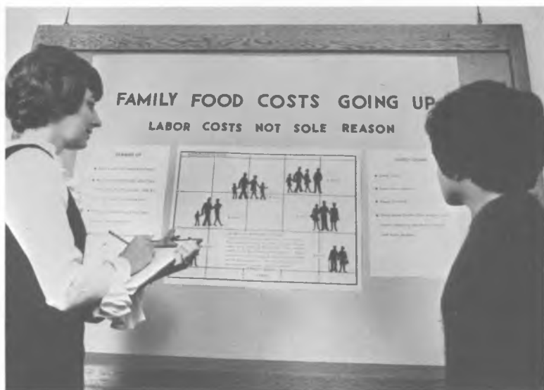
Students in management classes learn about family food costs ...and discuss food buying with a homemaker.