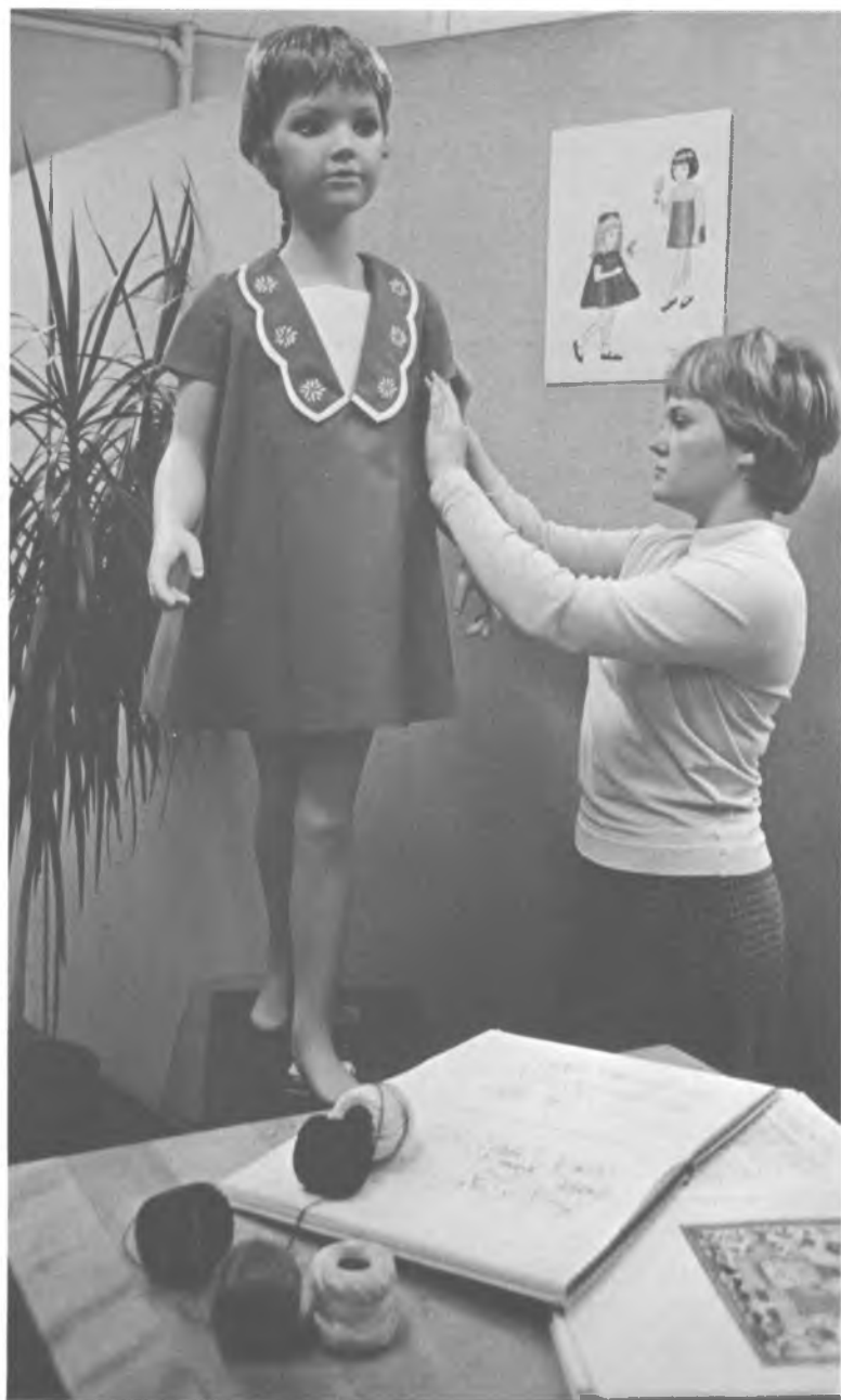
Emphasis is placed upon a study of the apparel design needs of people through involvement in studio problems.